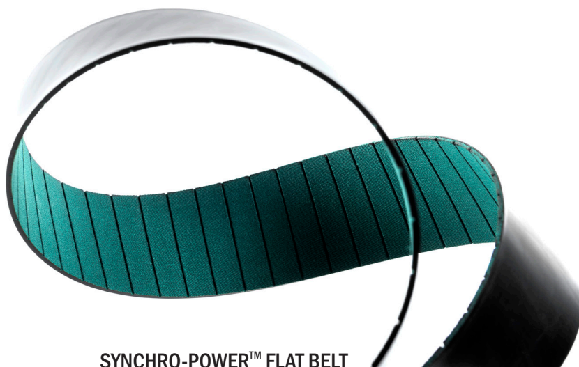
SYNCHRO-POWER™ FLAT BELT